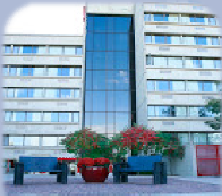
Gateway Room Example